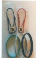
BRACELET/WRISTBAND – suggested donation £1