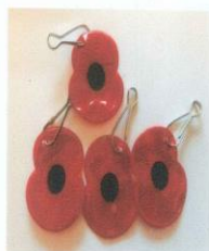
REFLECTORS – suggested donation 50p