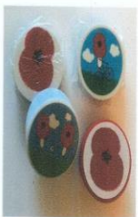
RUBBER/SHARPENER – suggested donation 50p