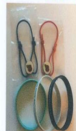
BRACELET/WRISTBAND – suggested donation £1