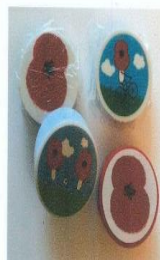
RUBBER/SHARPENER – suggested donation 50p