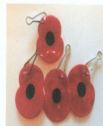
REFLECTORS – suggested donation 50p